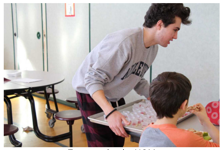
Taste testing by NOM

To get involved, please visit go/nom to sign up for our email list, check out volunteer opportunities, and learn more about what NOM does. If you have any questions, please email us at nom@middlebury.edu. We look forward to volunteering with you!